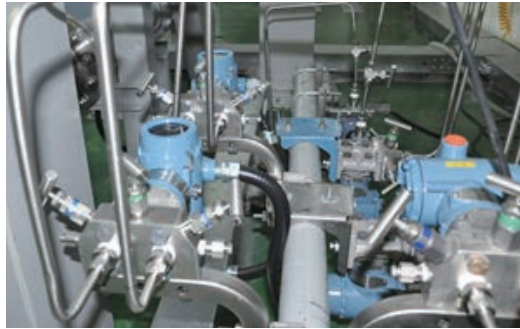
< Hydraulic Loop-2 >