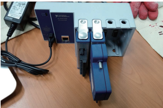
< Control System Equipment >