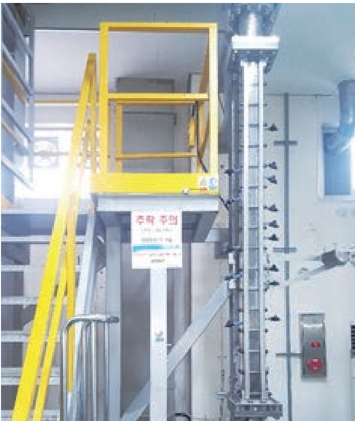
< Pressure Drop Test Equipment >

The pressure loss of coolant by fuel assemblies affects on the reactor power performance. The pressure drop test is to predict and evaluate the pressure loss characteristics of fuel assembly in simulated hydraulic conditions with a 5x5 fuel assembly specimen.